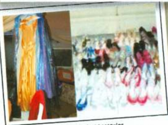
Dresses and accessories for Jamaica, Belize and Trinidad and Tobago