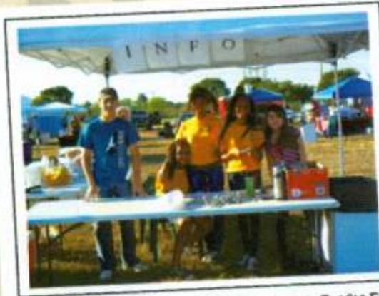
CAKC Members volunteer at SWR Arts + Crafts Fair