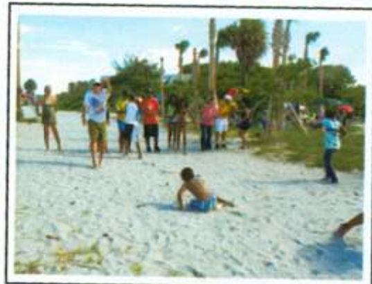
Fun and games at Family Beach Day