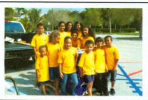
CAKC members working for Haiti victims

TATI, Inc would like to offer special thanks to the sponsors who were instrumental in making 2009 a successful year.