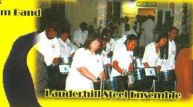
Lauderdale Steel Ensemble