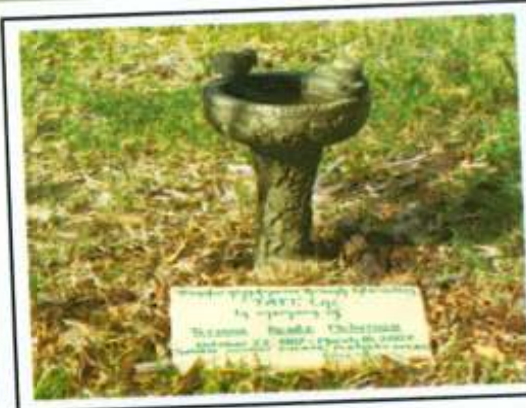
Dedication to Tatiana in Rolling Oaks Park